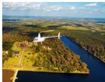
Scenic helicopter ride